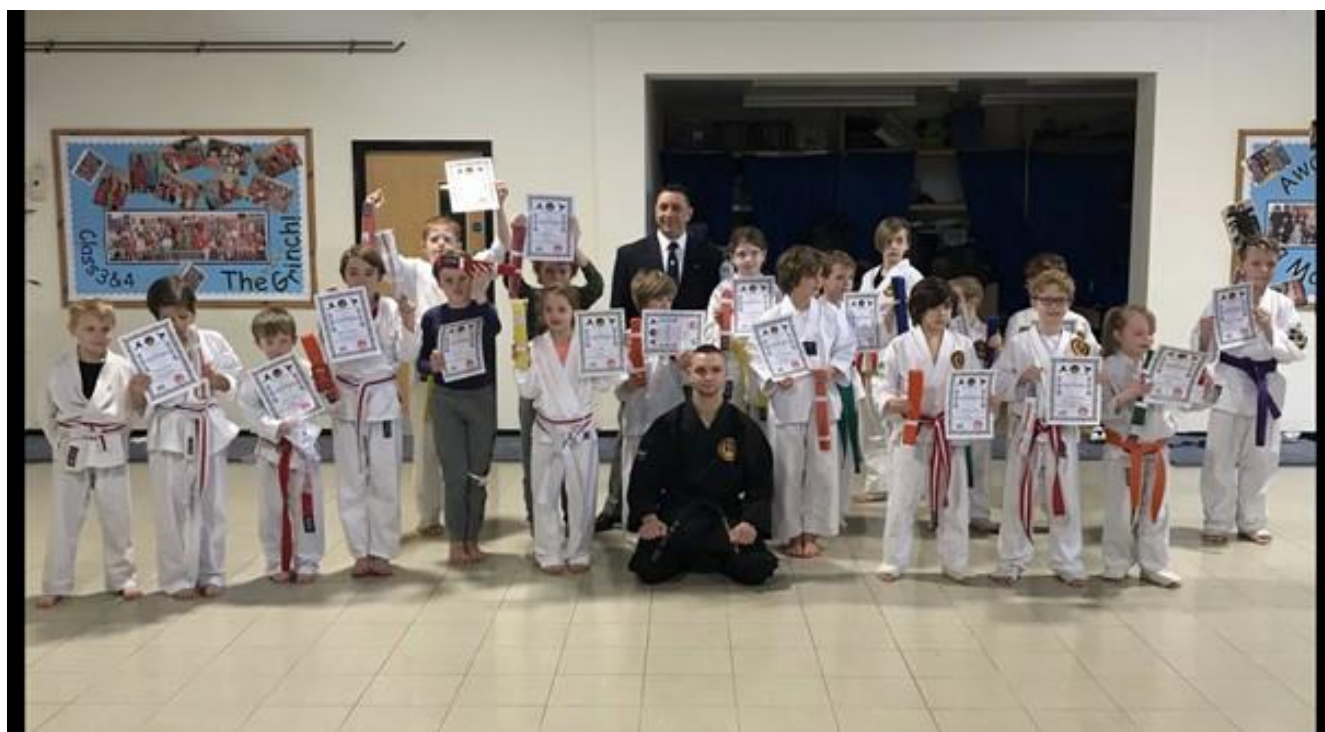
2 nd February 2020. Branton. UKD junior grading

We had fantastic success in February last year with 20 awards being achieved at the EKO National Karate Championships in Solihull.