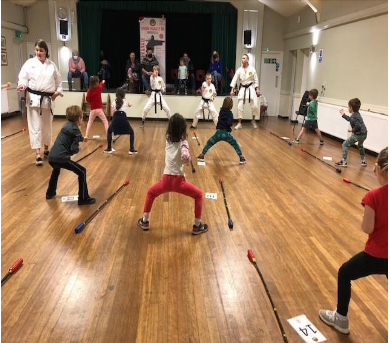
22nd December 2020, Croyde. Last early years class prior the third National lockdown