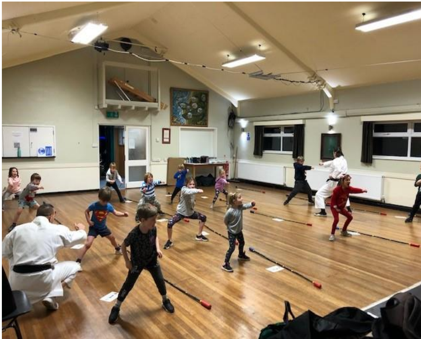
15 th December 2020, Croyde, Early Years Class First Merit Badge Session

At Union Karate Do we strive to encourage young people to set and achieve goals and in return they will be rewarded for dedication, achievement and consistency.