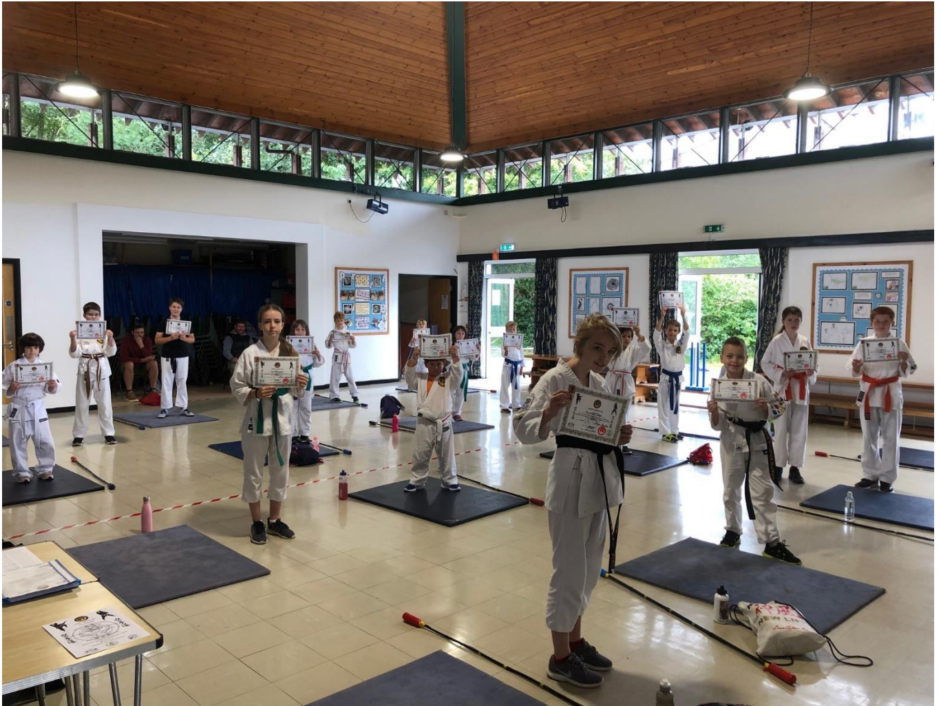
23 rd August 2020, Braunton, Junior kata Course