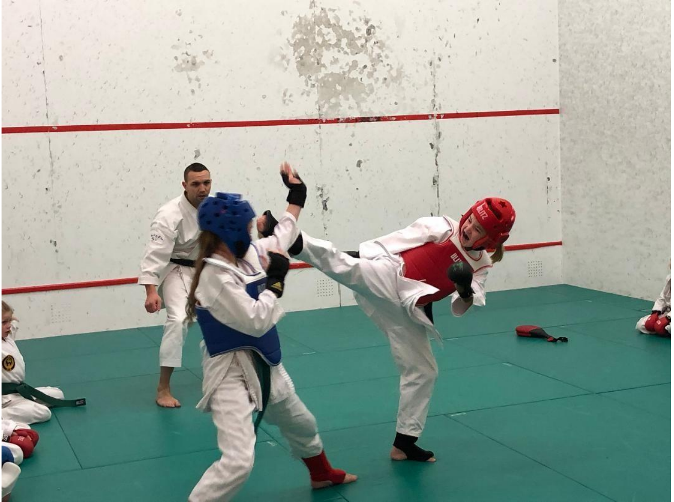
18 th February 2020, Chivenor, Juniors Sparring