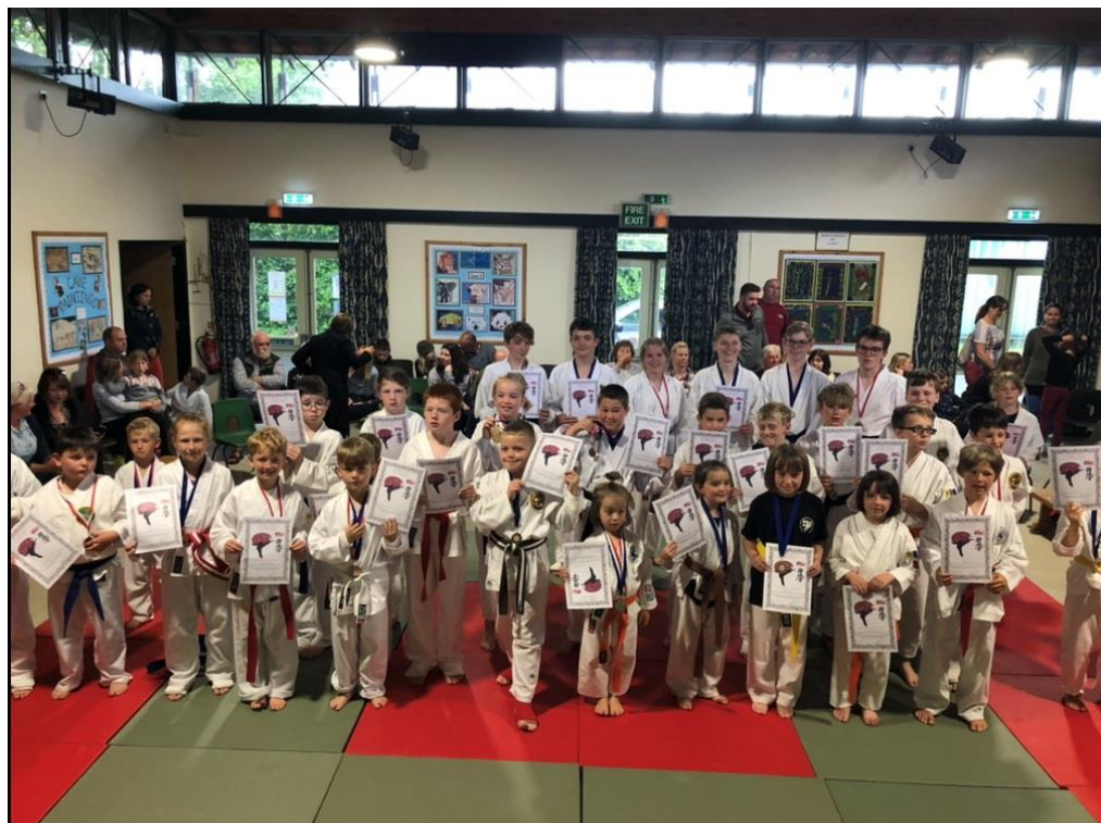
9 th June 2019, Braunton, Junior Interclub Karate Championships