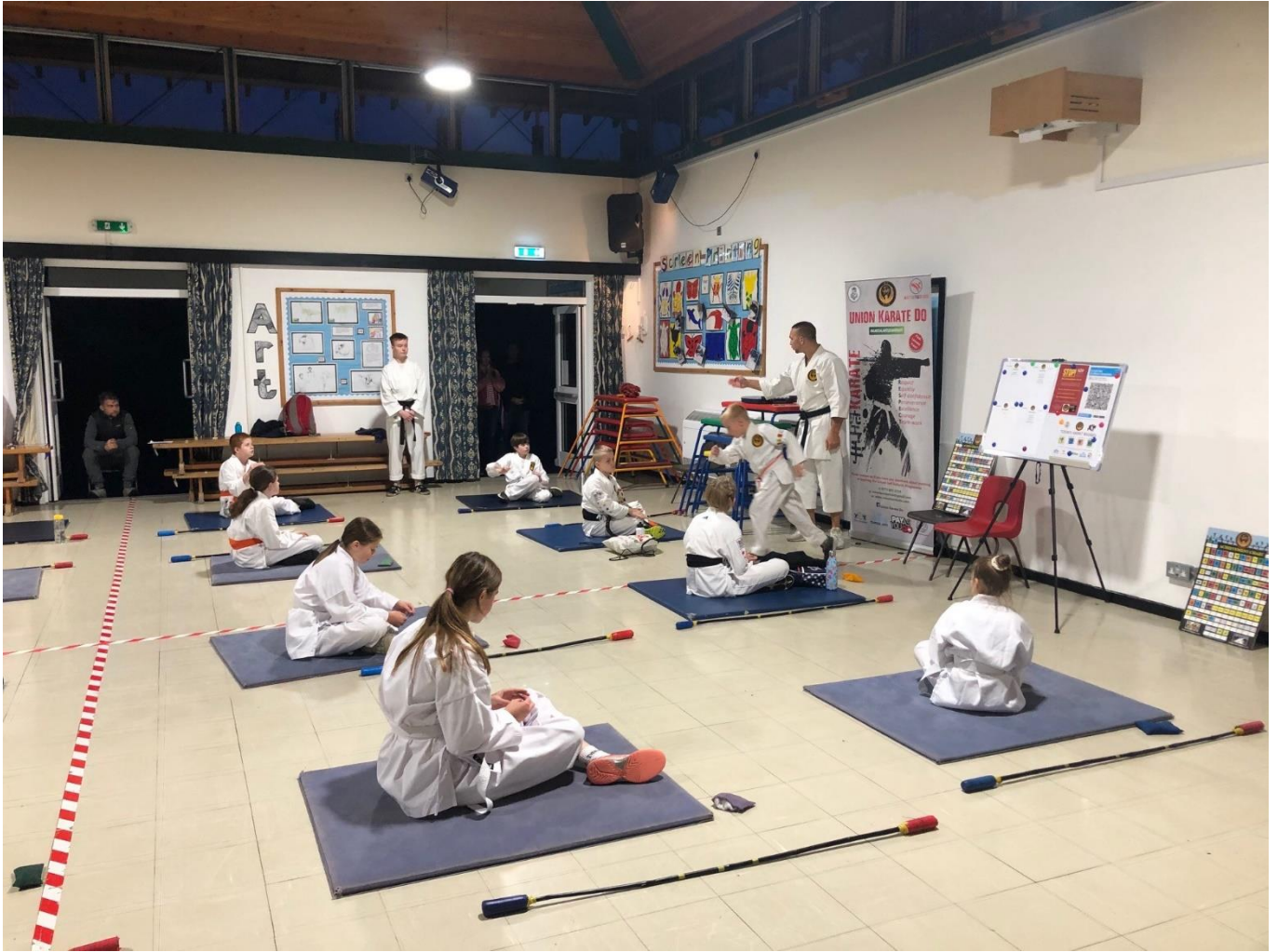
30 th September 2020, Branton, Intermediate Merit Badge Class