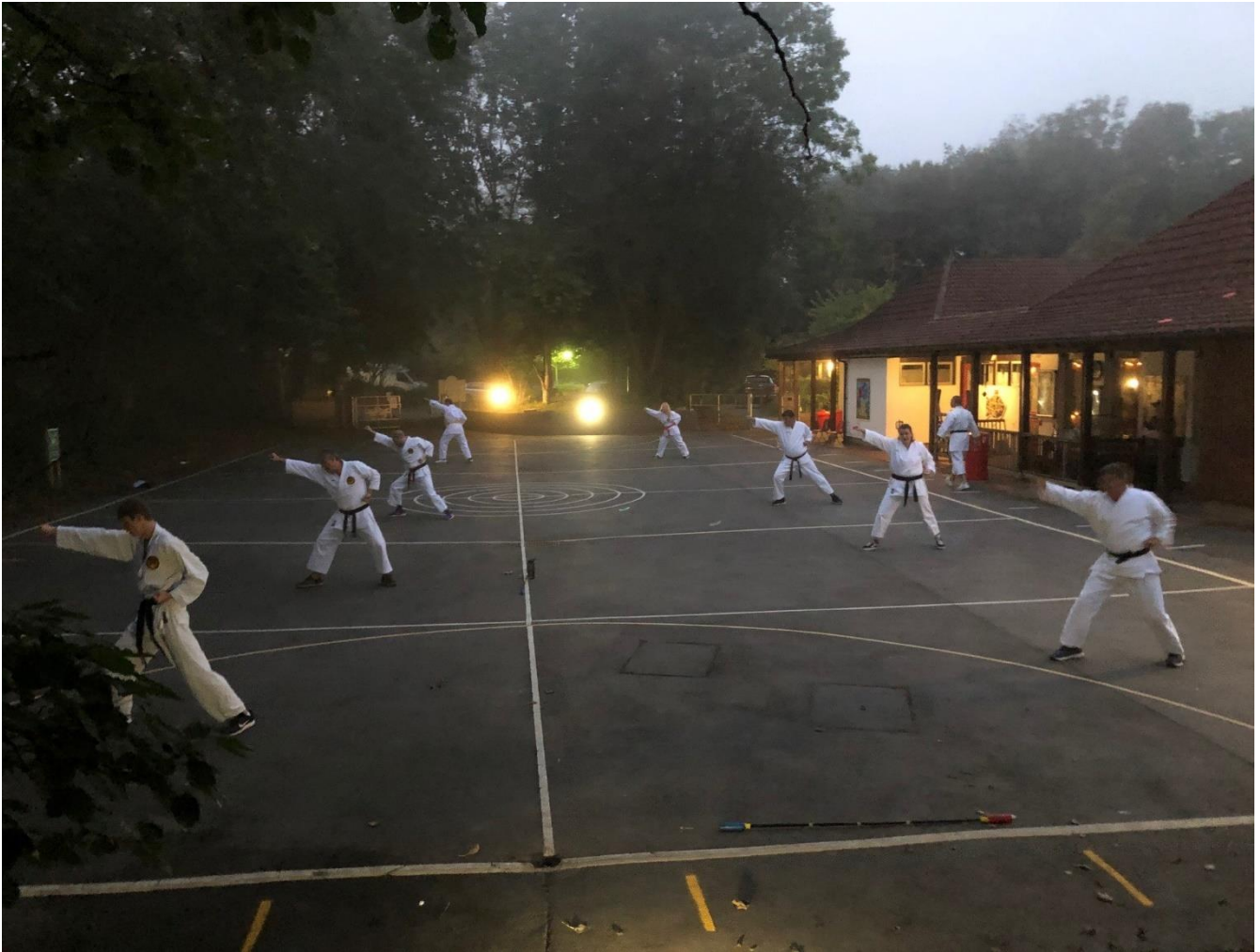
16 th September 2020, Braunton, Senior Students Evening Practise