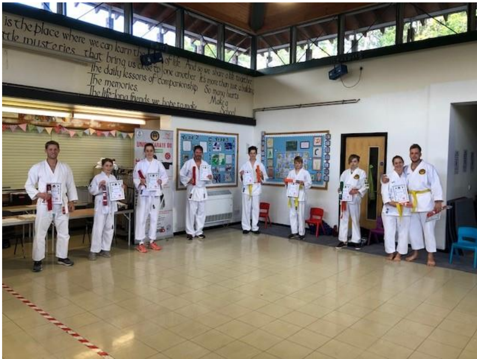
10 th October 2020, Branton, 4 th Grading Group of the day