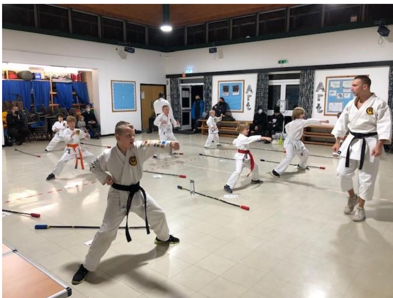
23 rd December 2020, Braunton. Last junior class prior the third National lockdown