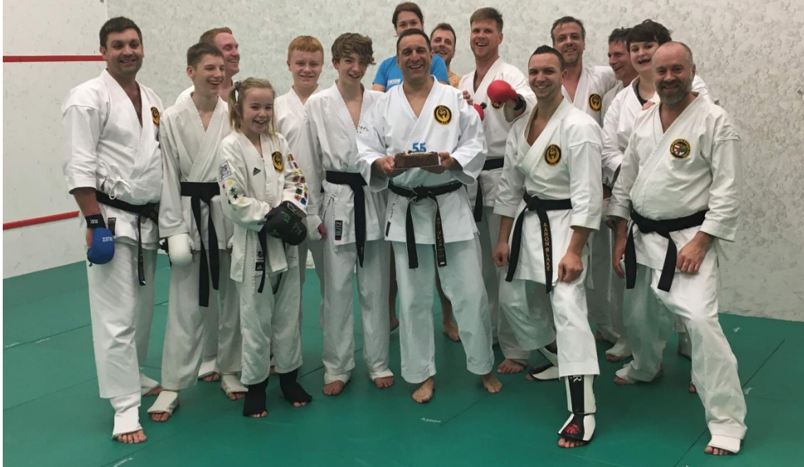
7 th January 2020. RMB Chivenor. UKD First Senior Class